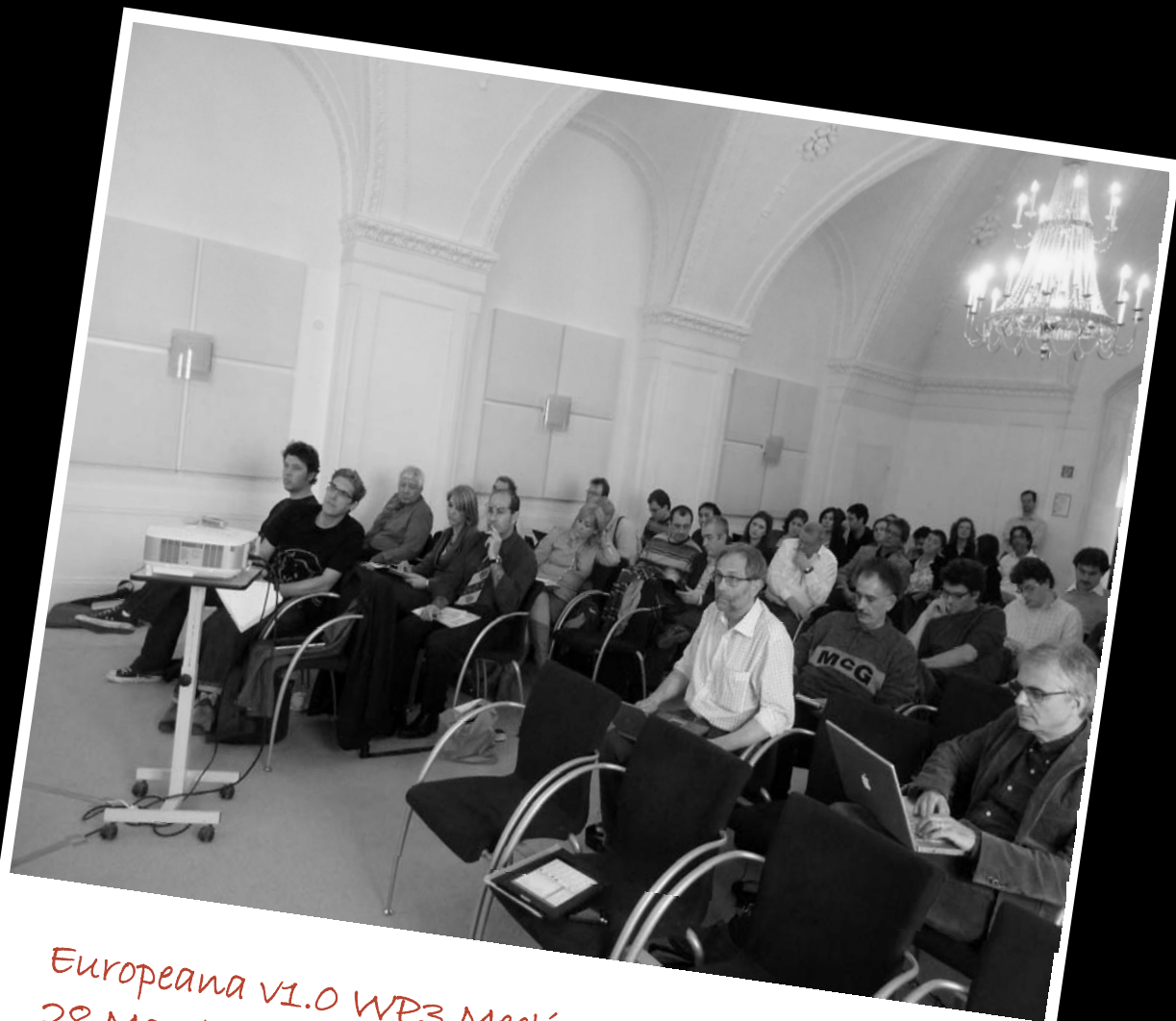
Europeana v1.0 WP3 Meeting Vienna, 28 March 2011